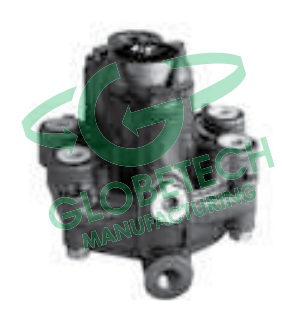
RG-2 relay valve

Body height: 5-5/64" Delivery ports: (2) 1/4" PT APT Delivery: (2) 3/8" PT Supply ports: (A) 3/4" PT